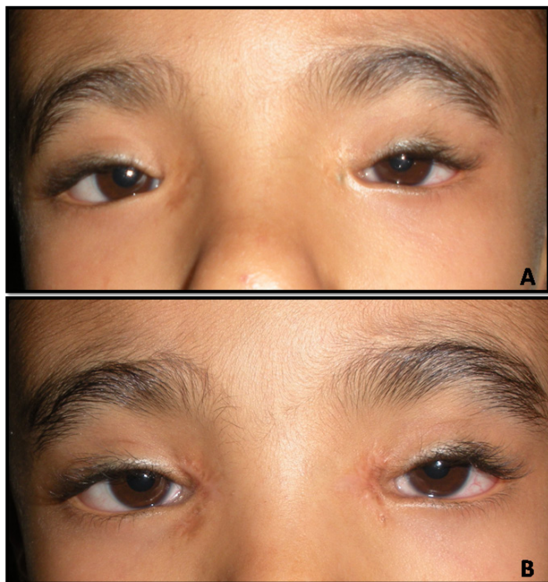
Figure 2 Patient with acceptable result of Y to V medial canthoplasty. A) Pre-operative showing IICD/HPFL ratio 1.9. B) Post-operative after the first stage surgery showing improvement of the IICD/HPFL ratio to 1.5.