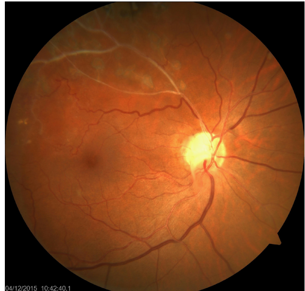
Figure 3 Fundus Photography of BRVO in superior temporal quadrant with prominent vascular occlusion.