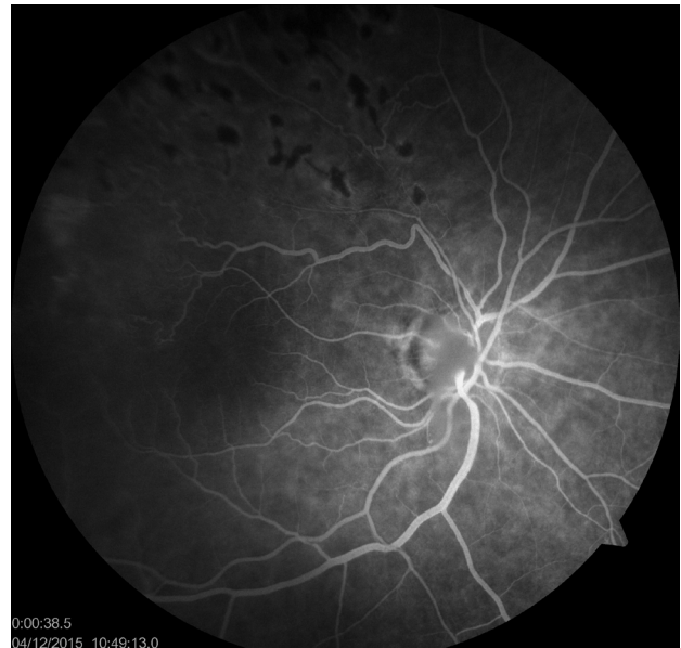
Figure 4 Focal Laser photocoagulation in ischemic peripheral retina in BRVO.

controls. In addition conventional laser treatment, but not PASCAL treatment, resulted in the up-regulation of VEGF. In Ito et al [27] study immunohistochemical analysis showed that PASCAL treatment was associated with lower VEGF and F4/80 expression levels compared with conventional laser treatment. They also suggested that the short pulse duration with the PASCAL induced fewer inflammatory cytokines in the sensory retina compared with the conventional pulse duration which may prevent macular edema after panretinal photocoagulation. Similarly Alasil et al [28] reported that PASCAL has minimized side effects of PRPC. But Chablani et al [29] observed that Laser spots from PASCAL treatment exhibited an increasing elliptical shape toward the retinal periphery which is not uniform shape comparing to that in central retina. This shape difference was indirect evidence of unequal laser energy that reached to the peripheral retina, whereas novel navigated (NAVILAS) laser spots tended to be more uniform all over the retina which indicates equal, uniform and more effective treatment can be performed by NAVILAS. NAVILAS has