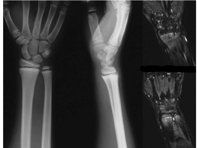
Figure 4 A 13-year-old boy with an undisplaced physal fracture of the distal forearm bones that was treated conservatively. A MRI was performed due to radial-sided wrist pain, following cast removal, 5 weeks post-injury. Short tau inversion recovery images showed bone bruising of the mid-portion of the scaphoid and fluid signal of the distal radioulnar joint.