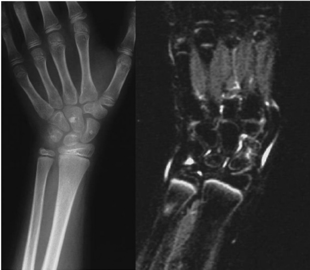
Figure 3 An 8-year-old girl with a radiographically occult scaphoid injury that was immobilized in plaster. A MRI was performed due to residual symptoms, following cast removal, 5 weeks post-injury. Short tau inversion recovery image showed bone bruising of the mid-portion of the scaphoid and fluid signal around most of the carpal bones. Two bone islands on the scaphoid and the capitate were found incidentally on the radiographs.