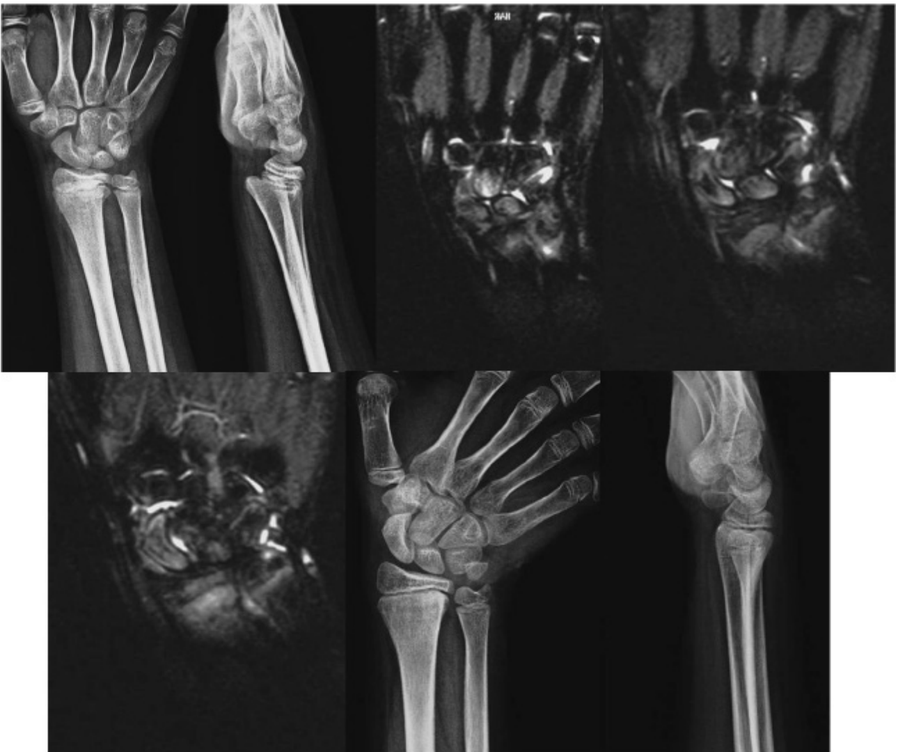
Figure 5 A 12-year-old boy was referred 2 weeks following a football injury (the ball forced the wrist into extension). The fracture was immobilized but reduction was not attempted. A MRI was performed due to radial-sided wrist pain, following cast removal, 5 weeks post-injury. Short tau inversion recovery images showed diffuse bone bruising of the carpal bones, including the scaphoid, with fluid signal between them. Further immobilization and protection was offered for a total period of 3 months post-injury. By that time the patient was symptom-free and radiographs indicated complete remodeling of the displaced fracture of the distal radius.