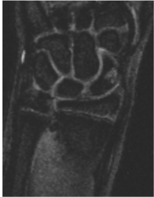
Figure 1 An 11-year-old boy with a radiographically occult scaphoid injury following a fall on an outstretched hand that was immobilized in plaster. A MRI was performed due to residual symptoms, following cast removal, 5 weeks post-injury. FL2D image shows bone bruising through the mid-portion of the left scaphoid.

radiographic imaging remains normal and recovery is significantly prolonged, represent a true diagnostic dilemma (Figures 1, 2, 3). The latter group includes patients with distal forearm fractures that were treated conservatively. Residual scaphoid symptoms and signs following the treatment of distal forearm fractures also pose a diagnostic enigma (Figures 4, 5).