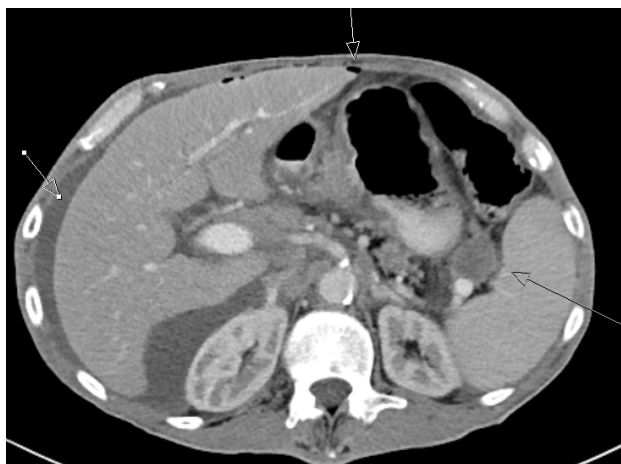
Figure 1 Arrows clockwise from left pointing at free fluid, air bubbles and enlarged lymph nodes.