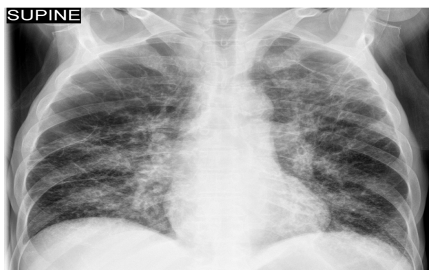
Figure 3 Chest X-Ray showing severe COPD and no free air under the diaphragm.

hemicolectomy, gastrojejunostomy, and ileostomy were performed to excise the mass and the fistula [3] The remaining colon was closed with a stapler. We performed an extended right colectomy without anastomosis because we did not want to do another anastomosis in the fecal peritonitis environment; moreover, at the time of the operation his rectal adenocarcinoma status was not clear. Negative margins were taken. The pathological report was significant for primary gastric adenocarcinoma without lymph node metastasis.