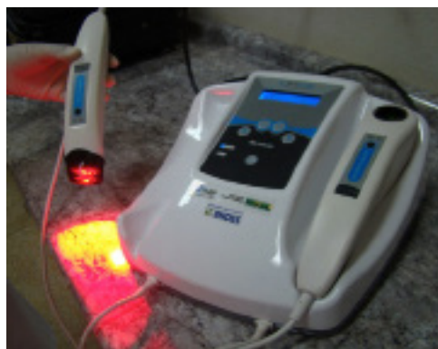
Figure 3 LINCE device by MM Optics. The probe in the physician hand is the treatment probe, composed by LED arrays emitting at 630 nm. The probe resting at the console is the evidencer probe, which is composed by ultraviolet-visible LED arrays and optical filters for adequate selection of the wavelengths delivered to the sample and back to the observer's eye.

Lesions treated under PDT Brazil program are exclusively non-melanoma skin cancer, either superficial or nodular basal cell carcinoma (BCC) type, up to 2 cm in diameter and up to 6 mm infiltration, with histopathology confirmation (Figure 4). Highest incidence among the treated lesions was in elderly patients (60+ years old), in the face - probably due to the accumulative effect of sunlight UV radiation on skin over the years. To increase the cream penetration and favor light absorption into the lesion, a curettage procedure was introduced to the standard protocol, aiming to increase the volume of tissue treated. The three-hours time interval between the cream administration and the illumination is necessary for the PpIX production by the ALA in the cream [7] . ALA, which is a precursor of PpIX (and a direct by-product of MAL), is a hydrophilic agent that penetrates cells by active transport and