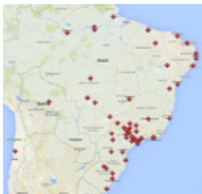
Figure 1 Distribution of the upcoming treatment centers established during the first phase of the PDT Brazil program [89] .

in the treatment had previous experience with PDT, due to two main factors: the expertise in referring to PDT treatment lesions that are more appropriate for this approach, and a more adequate preparation of the lesion for the procedure, such as sufficient curettage and administration of the methyl aminolevulinic acid (MAL) photosensitization cream (Figure 2). The results showed that a large-scale program for the treatment of small skin cancer lesions is viable; these results are so positive that new centers are continuously being added to the program, and treatment follow-up data are still being collected for future, more comprehensive analysis. A core result from this approach is that the involved countries currently start to face a new reality concerning skin cancer treatment due to this program [7] .