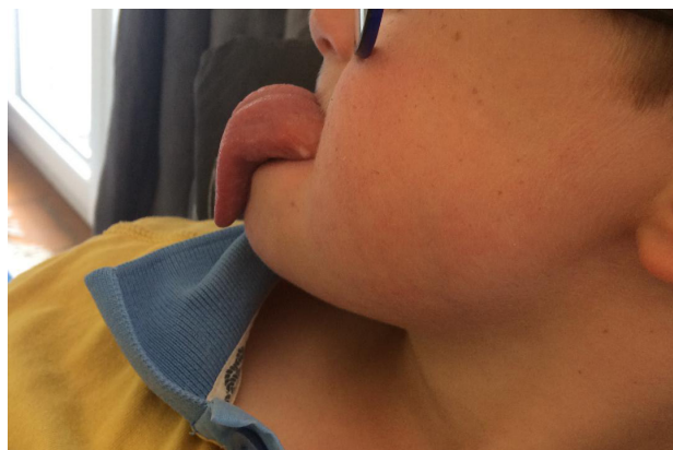
Figure 2 After spontaneous regression remains a small white bulge.

Benign tumors of the tongue are rarely reported in children and adults with DS [2] . A fibro-proliferative polyp with fibrous architecture different from a botryomycoma has been resected from the left border of a tongue in a young boy with DS [3] . Three cases of Riga-Fede disease of the ventral tongue have been described in young children with DS [4] . These traumatic reactive lesions with indurated well defined borders which contains many lymphocytes, macrophages, plasma cells and numerous eosinophils. Rega-Fede disease may disappear after removal of the traumatic cause, smoothening of incisor edges or covering dental edges with composite resin. Recurrence of a resected botryomycoma rarely occurs and must not be considered as the indication of a malignant process.