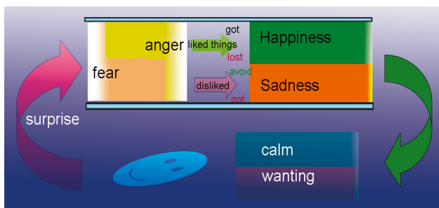
Figure 2 life is normally calm, everything is as expected; then something unexpected happens, people first feel scared (fear) and then blame (anger) the reasons for the unexpectancy after fear is gone; then people feel happy or sad depending on whether the thing happened fits for their needs or not. Finally, the thing passes away, and people calm down from the happiness, or feel missing and wanting for the lost thing.

Even though there are many standards for primary emotions, the most important is that they should exclude each other, which means that they should not occur at the same time. Like we talked before, anger and fear never happen in at the same time in a same person, so it is with happiness and sadness. It might also be right with calm and wanting. The second rule is that they should be able to make all of the emotions, like the 7 colors in rainbows. Let us end our paper with an example of the emotional changes in everyday life (Figure 2): life is normally calm, everything is as expected; then something unexpected happens, people first feel scared (fear) and then blame (anger) the reasons for the unexpectancy after fear is gone; then people feel happy or sad depending on whether the thing happened fits for their needs or not. Finally, the thing goes away, and people calm down from the happiness, or feel missing and wanting for the lost thing.