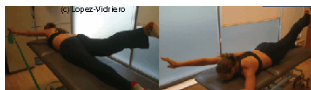
Figure 4 Cross chain kinetic strengthening exercises. Based on Anne Cool's approach. Strengthening of the parascapular muscles in combination with cross kinetic chain reinforcement is of most importance.