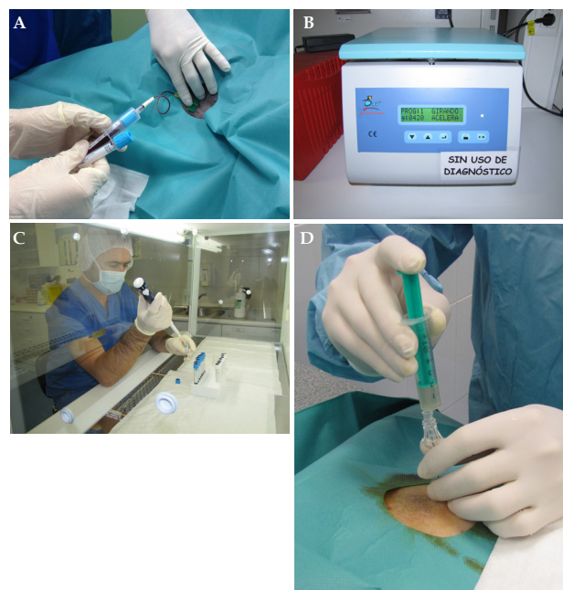
Figure 2 Intraarticular infiltration of PRGF in hip.

Among the various plasma preparations one will find Plasma Rich in Growth Factors or PRGF ® , this is the most advanced autologous PRP system, marketed by the Biotechnology Institute, BTI. It has CE certification for European health authorities, and is approved in Europe for the production of plasma growth factors and their application in various medical specialties. In the USA it is marketed under the name PRGF-Endoret ® , and is a pioneer in the development of specific protocols for tissue regeneration as well as being the first 100% autologous technique on the market. Its advantages include [44] (Figure 2): (1) Biocompatible, versatile and safe; (2) Controlled