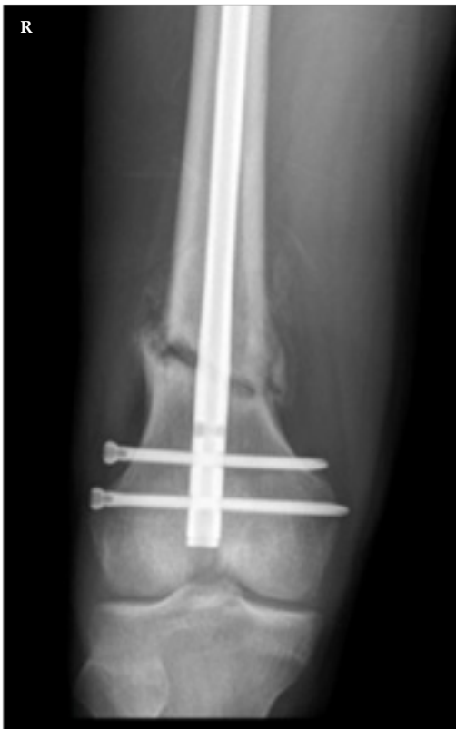
Figure 2 Post-op radiograph - Right, AP, post retrograde femoral intramedullary nailing.