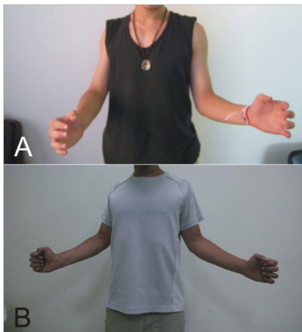
Figure 1 A. Clinical examination of the right shoulder showed evident external rotation limitation. B. Improved external rotation of the shoulder 6 months after surgical excision.

shoulder (Figure 2). There was no evidence of a rotator cuff tear, osteochondral lesion, or labral lesion.