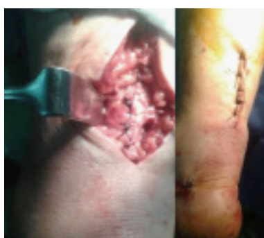
Figure 6 Achilles tendon sheath and skin is closed.