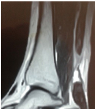
Figure 1 Pre operative MRI of one case.