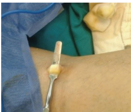
Figure 2 Semitendinosus tendon graft delivered from a mini incision.