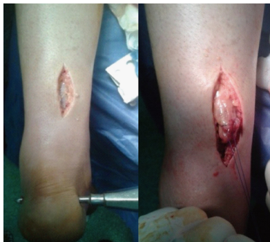
Figure 4 The tendon graft passing through the calcanean tunnel.