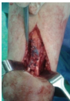
Figure 5 The graft is sutured to the proximal stump of Achilles tendon.