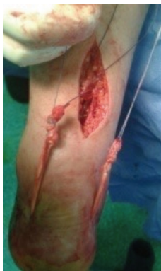
Figure 3 Incision over the proximal stump of Achilles tendon.

rupture due to direct blow to the posterior aspect to the distal part of the leg. One patient had open tendon cut by a sharp instrument and was missed for 5 months.