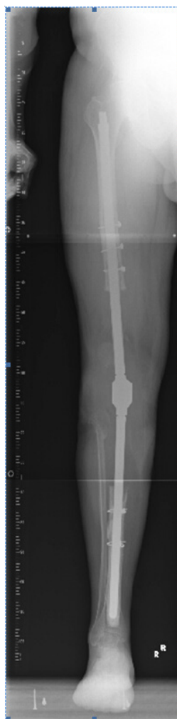
Figure 1 X-ray leg axis after implant arthrodesis for defect bridging (> 30 cm)

Prior to using modular arthrodesis systems, the intramedullary