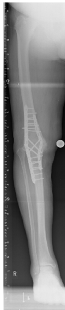
Figure 2 X-ray leg axis after double-plate arthrodesis (LCP 4.5).

cavities are prepared with drills and reamers, followed by jet lavage. Tibial and femoral sample implants are available during surgery. The appropriate leg length can be adjusted by means of sample coupling elements. The coupling elements have a valgus angle of 0 or 6 degrees. Flexion is 7 degrees. Coupling is performed following rotation control. As soon as the size has been identified, the definitive implants are used. The shaft can be implanted with or without using cement.