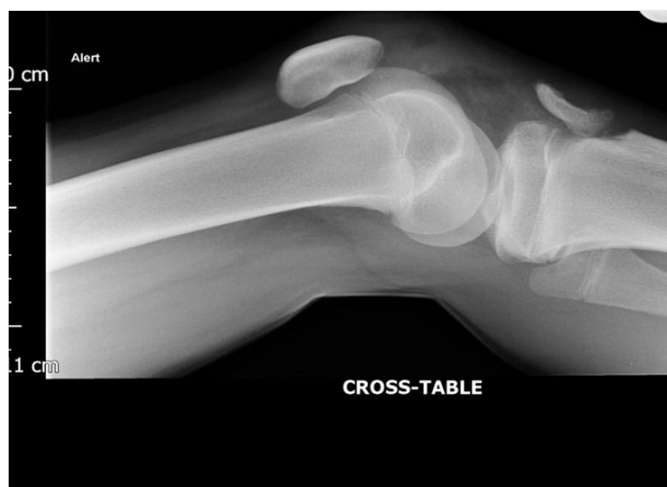
Figure 1 Trauma radiograph of the knee demonstrating tibial tuberosity avulsion with the fragment rotated 180° and patella alta.

Combined tibial tuberosity avulsion and patellar ligament rupture