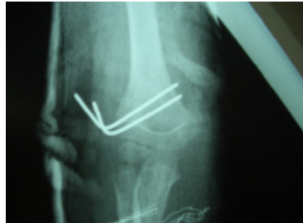
Figure 2 Postoperative AP X-ray. Supracondylar fracture of the humerus (Gartland type II) laterally approached with 2 K-wires.

As the sample does not follow a Gaussian distribution, we apply nonparametric test. The Fisher test was used for the analysis of the