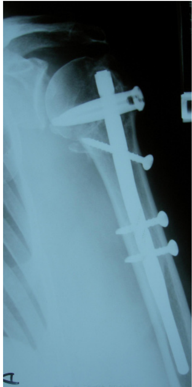
Figure 2 Postoperative X-ray showing the nail with the spiral blade and the three screws.

This study supports the use of intramedullary nails for selected fractures of the proximal humerus in both young and older patients with osteoporosis. The PHN with spiral blade and guided