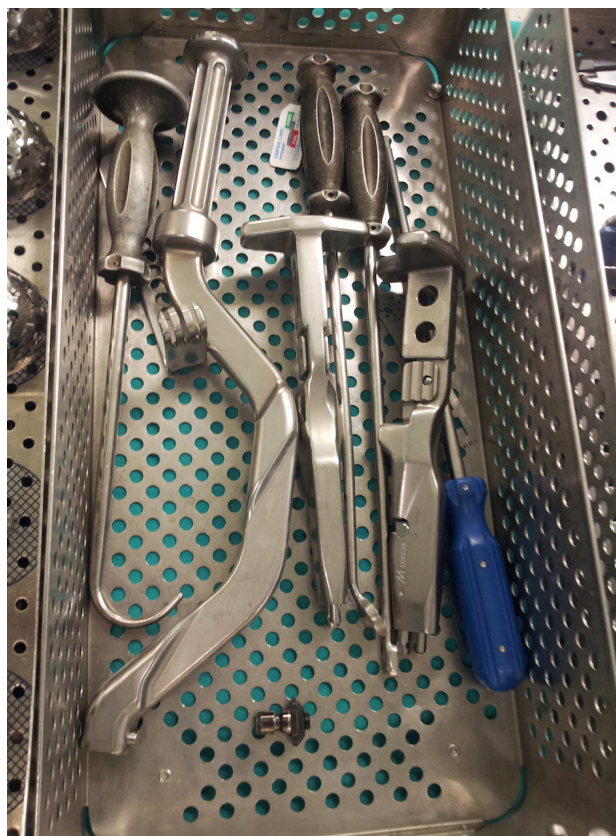
Figure 3 Part of instrumentation used during an Anterior Minimal Invasive Surgery (Medacta International SA, Castel San Pietro, Switzerland). Note the hook used to lift the proximal femur and the curved instrument for receiving different sized rasps.

75 ( p < 0.0001 ). The preoperative score was the same for these two groups.