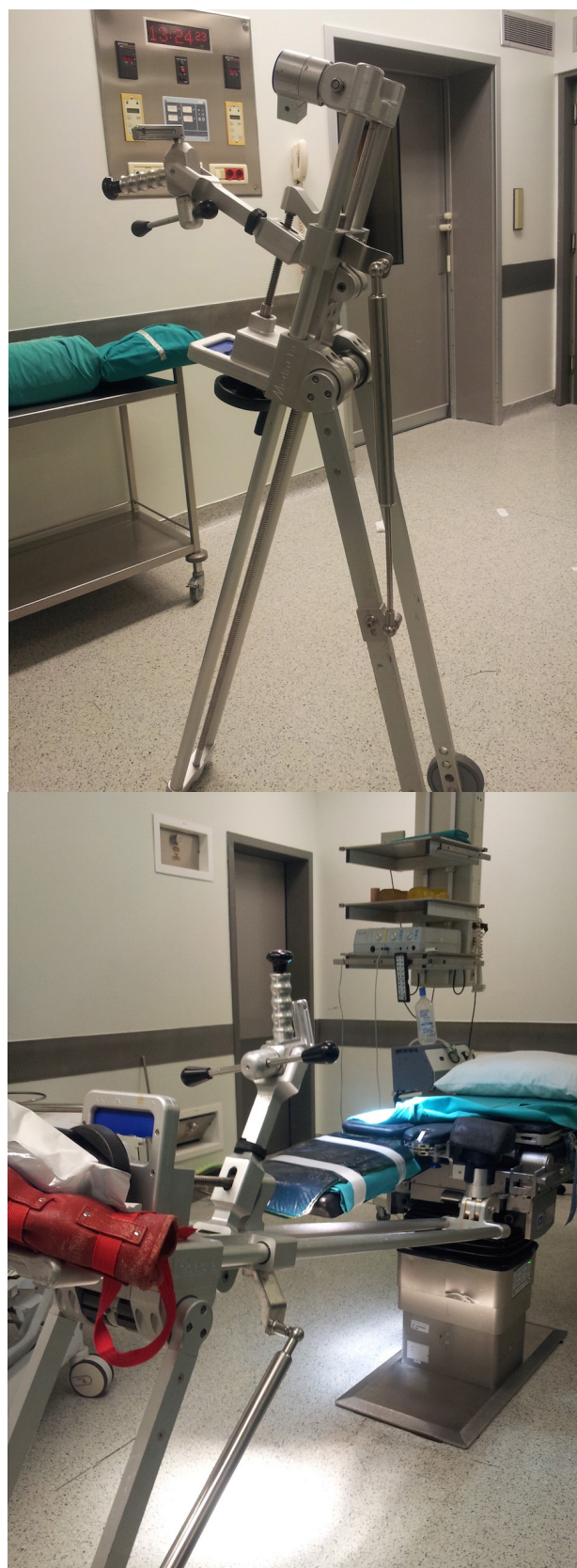
Figure 1 Special extension for a traction table (AMIS Mobile Leg Positioner, Medacta International SA, Castel San Pietro, Switzerland) that facilitates optimal leg positioning during a direct anterior approach surgery. A) Leg positioner folded, B) Leg positioner placed on traction table.

As a retractor is placed over the superolateral aspect of the femoral neck the surgeon should be careful in order to recognize and cauterize or ligate the branches of lateral femoral circumflex artery, as they are in the surgical field and an injury of them can cause bleeding, which may be difficult to control, if the artery branches retracted [13,15] . Then a retractor inferior to the femoral neck is placed. A third retractor may