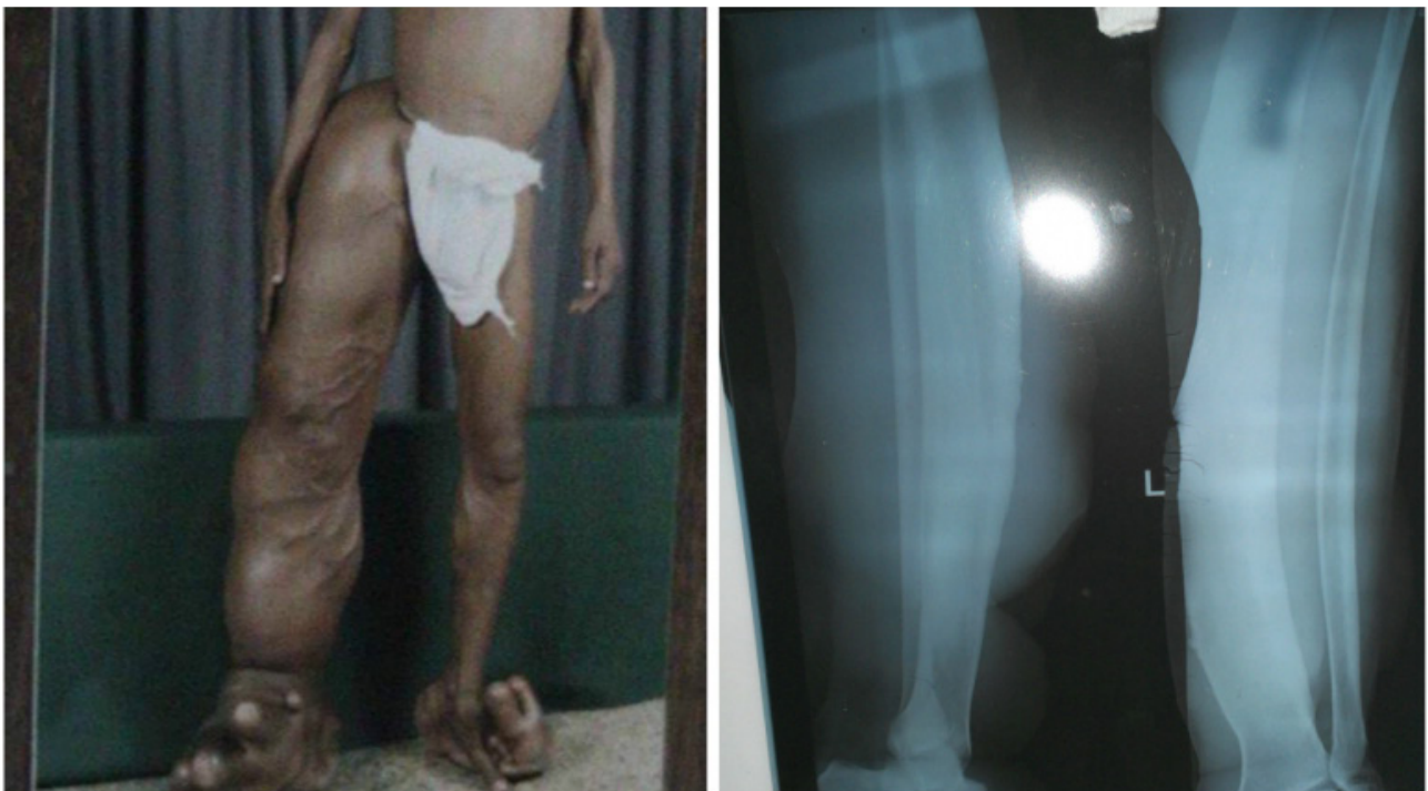
Figure 2 38 year male patient with Giant lowerlimb clinical photograph and X-ray.