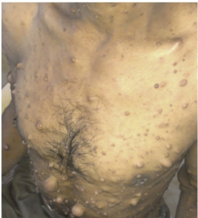
Figure 4 Associated Neurofibromatosis with giant lowerlimb in male patient.