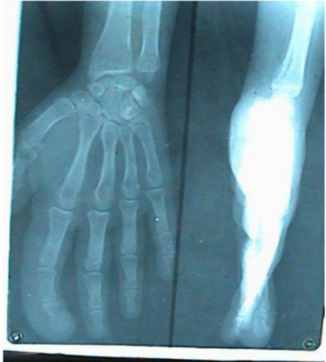
Figure 3 Radial Mega thumb and index finger of 8 year old female.