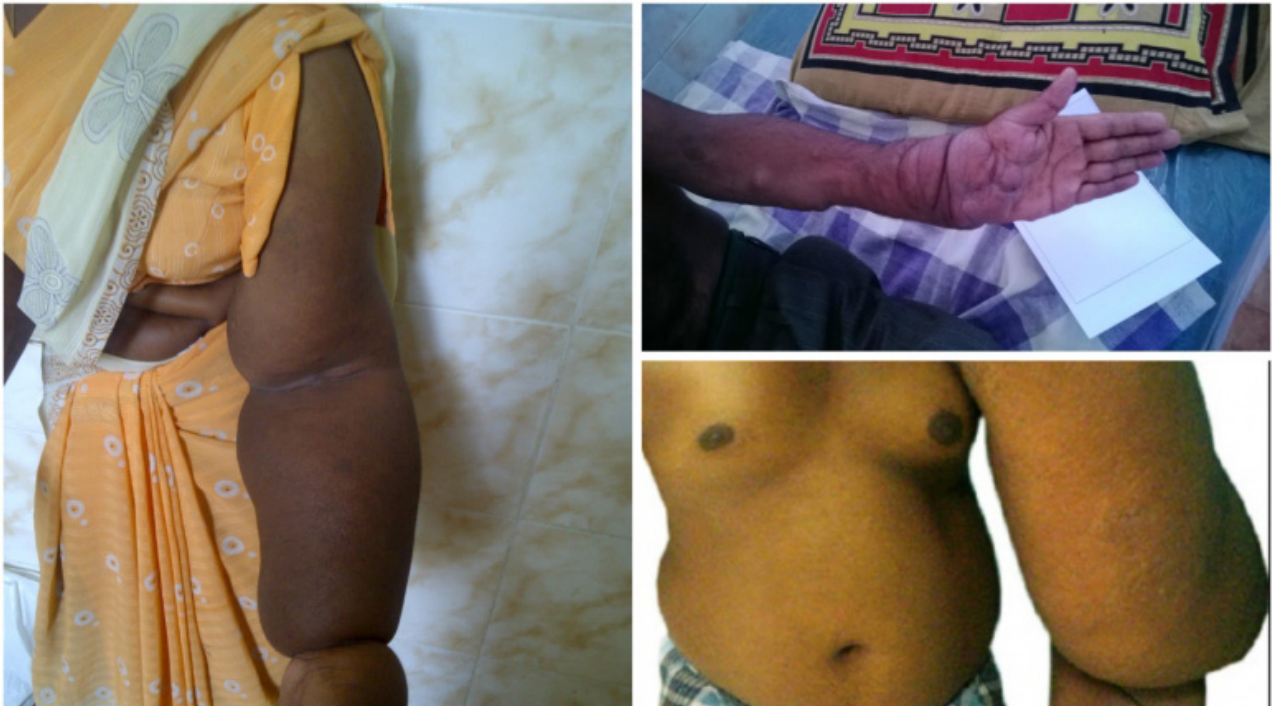
Figure 5 Giant upper limb- 3 cases.

Plain radiographs demonstrate abnormalities in both the soft tissues and bony elements. The affected long bones, phalanges and metatarsal bones show an increase in width and length, and are often splayed at their distal ends, giving a mushroom like appearance. The