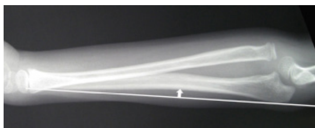
Figure 2 Ulnar bow should be measured to detect ulnar bowing.