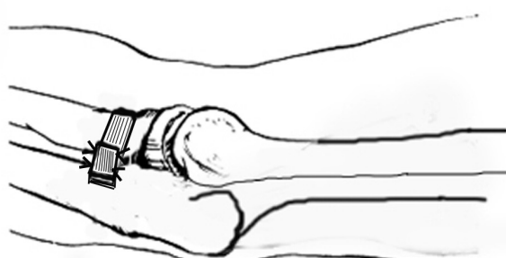
Figure 5 The fascia lata is passed and wrapping it around the radial neck from the ulnar and securing it through a drill hole in the ulna.

postoperatively with rapid consolidation.