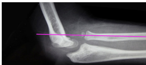
Figure 1 Head radial dislocation.