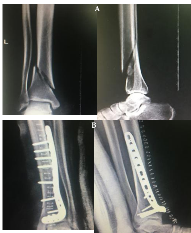
Figure 2 A: pre-op X-ray left leg AP and lateral view. B: post-op X ray left leg AP view and lateral view.

who came to our hospital Grouped into Group I and Group II. For each Group, patients were selected consecutively. Group I ( n = 21 ) patients were treated with Intramedullary interlocking nail; Group II ( n = 21 ) patients were treated with open reduction and internal fixation with Plating.