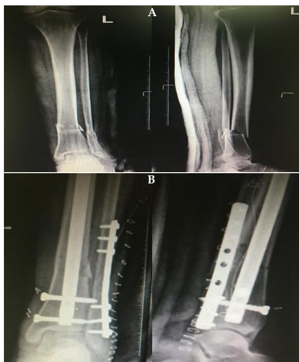
Figure 1 A: pre-op X-ray left leg AP view and lateral view. B: post-op X ray left leg AP view and lateral view.

All patients attending the orthopaedic department with extra-articular fracture of distal tibia who met the inclusion criteria were counselled regarding the disease and the study and those willingly consenting to participate in the study were selected. Informed and written consent was obtained from all patients with consent form approved by the Institutional ethical committee. A total of 42 subjects were consecutively recruited for the study. The Patients with Distal tibia fracture