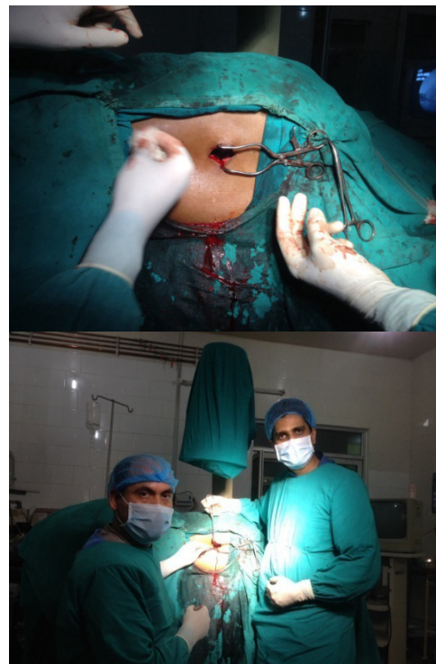
Figure 4 and 5 Retractor and C-arm used.

and more than half of them were \geq 40 years which was similar to Grag B et al [18] . ( 38.7 \pm 8 years), Jaff, H et al [19] (40 years) and Weir BK et al [20] (41.7 years).