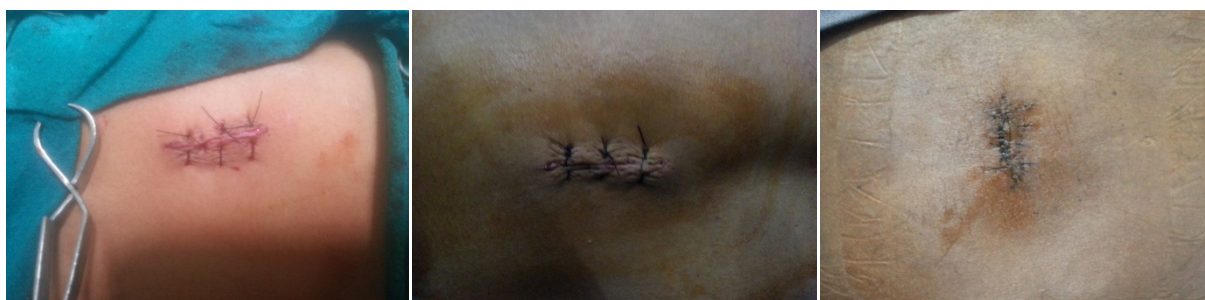
Figure 8, 9, 10 Suture applied and removed after 2wks.