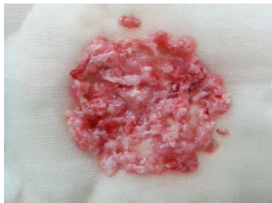
Figure 6 Disc delivered out.

Regarding neurological evaluation, there was no improvement in deep tendon reflex and sensory deficit till 3 months. But, regarding motor deficit out of 10 patients only 3 patients had improvement at 3 month. Righesso O et al [30] also did not find satisfactory outcome regarding neurological improvement which was similar to our study.