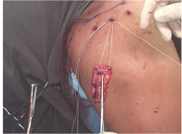
Figure 3 Insertion of the Graft.

Repairable partial and/or full infraspinatus and subscapularis ten-