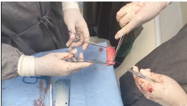
Figure 2 Fascia Lata preparation for superior capsular reconstruction.