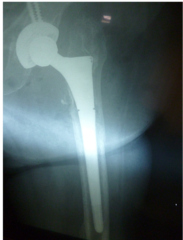
Figure 6 Hip prosthesis of the revision type is evident the bad bone quality, lack of medial support and a negative vos sign.

In conclusion, we presented a case so far not reported, of successive atypical ipsilateral fractures of the diaphysis (this