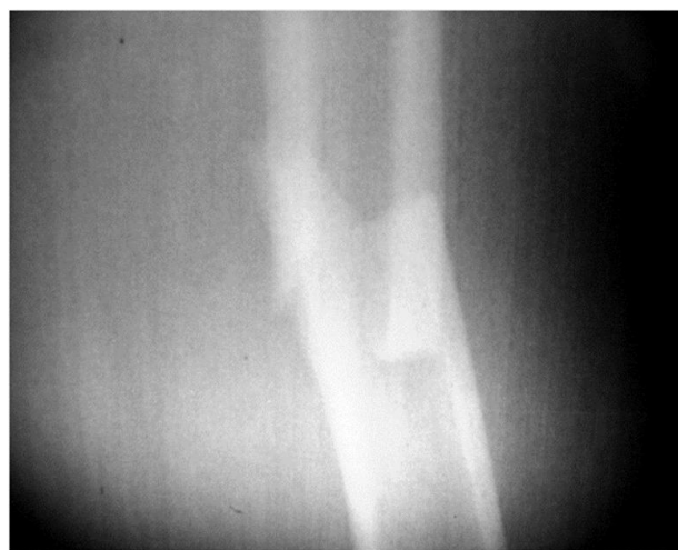
Figure 1 Transverse fracture of the left femoral diaphysis in the lower third. It starts in the lateral cortex, has a transverse line, takes both cortices and ends at the medial cortex with a slight spike (AO-ASIF Classification. 32 A3) [5,6] .

Intramedullary nailing is the first-line treatment for a complete femoral atypical fracture, although the risk of delayed healing and revision surgery seems to be higher than with a typical femoral fracture [10] . Orthopedists treating fractures of the femur have not agreed on the entry site of the anterograde femoral nail; studies done on cadaver bones remain inconclusive, because for some the ideal point is the medial edge of the trochanter near the insertion of the muscle piriform [11] while for others it is the trochanteric or piriform fossa, the latter with much controversy [12] . In any case, an incorrect entry point can lead to stresses between the implant and the bone, inducing other iatrogenic fractures [13] . In this particular case, the nail at the insertion site did not stay flush with the cortex of the greater trochanter (photo 2) because this fact allowed the gluteal muscles it’s irritating, generating limping in an abduction.