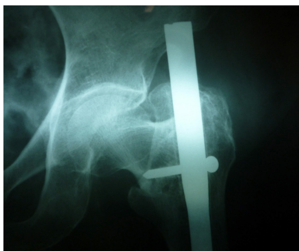
Figure 2 Technical failures are evident that it was not introduced flush with the trochanter. It gives the impression that the neck is in varus.