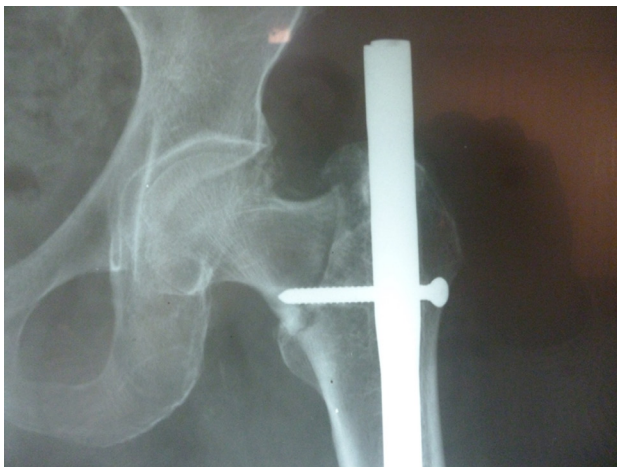
Figure 4 Basicervical fracture (AO 31B3).

One of the most important clinical signs [16] is the prodrome pain at the groin level, as in our case to tell us that a stress fracture has started. This type of fracture can happen in two ways: by compression and tension [17] ; those of localized compression in the inferior cortical of the neck, below the periosteum or endosteal, that makes suspect bony callus formation with apparent indemnity of the trabecular pattern; while that of tension begins in the superior cortex with a line perpendicular that if it injures the trabeculae [18] . These are not frequent injuries, they often go unnoticed or are not thought of. They can represent between 5% and 10% of all fractures