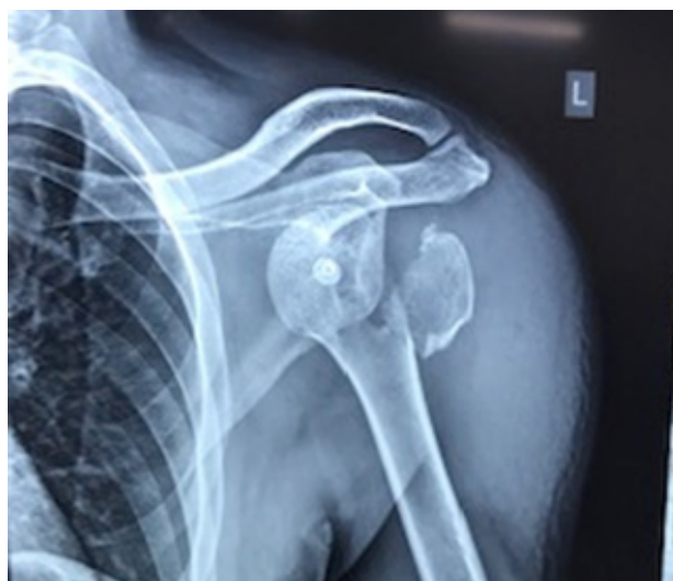
Figure 7 X ray of the Left shoulder showing a posterior fracture / dislocation.