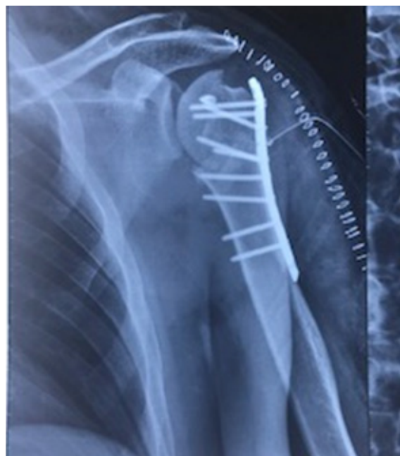
Figure 5 Immediate post operative X ray.