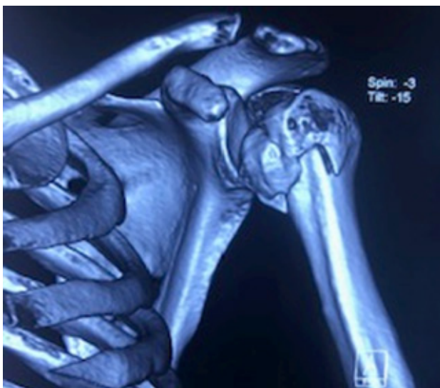
Figure 2 Pre operative CT Scan of the shoulder.