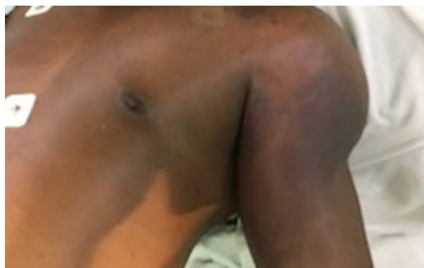
Figure 6 Picture of the left shoulder.

21 year old alcoholic was seen at the emergency department with a history alcoholic withdrawal and delirium tremens. He had history of convulsion one hour prior to review and he convulsed again at casualty and injured the opposite shoulder. He then had continuous tonic clonic seizures and was initially sedated and admitted to the HDU for management. Pre operative X ray of the left shoulder revealed a posterior fracture dislocation (Figures 6 and 7) and the right shoulder revealed undisplaced proximal humerus fractures (Figure 8). After control of the seizure disorder he was taken to theatre for open reduction and internal fixation of the right shoulder. The dislocation was reduced and the fracture fixed using a proximal humerus locking plate (PHILOS plate). The opposite shoulder was managed conservatively in an arm sling. On follow up both injuries healed well and at one year follow up had full recovery and normal range of motion.