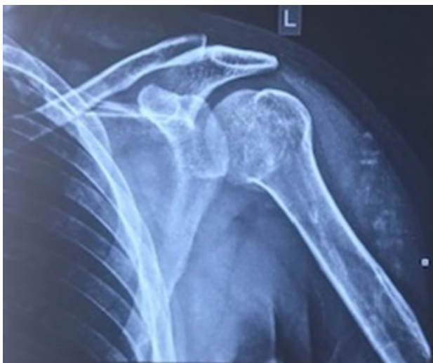
Figure 1 Initial AP X ray of the shoulder.

The neurovascular status of the right arm and forearm was normal. An X-ray and CT Scan of the shoulder showed a locked posterior dislocation fracture of the right shoulder (Figures 1-4). He was operated on the same evening: the dislocation fracture was reduced and fixed using a Philos locking plate and modified Mc Laughlins procedure