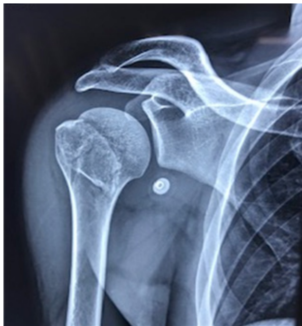
Figure 8 X ray of the right shoulder showing an undisplaced 3 part fracture.