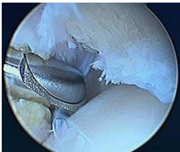
Figure 2 Anterior impingement removal with motorized oscillating shaver.

It ranks from grades I to IV. If there are only soft-tissue lesions the morphologic alternations are subject to MRI or surgical intervention. Synovectomy of joints in patients with rheumatoid arthritis (RA), helps reduce pain and prevent or delay articular cartilage destruction [16-18] . Arthroscopic synovectomy is associated with a low rate of complications and is often successfully performed in the knee and other joints [16-18] . Currently, few published data exist concerning arthroscopic synovectomy of the ankle joint in patients with RA [19] .