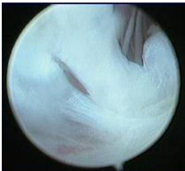
Figure 1 Hypertrophic scar tissue with a fibrous band appearance called lateral meniscoid.

In 1992, Scranton and Mc Dermott presented a grading system of the impingement syndrome according to X-ray image findings [15] .