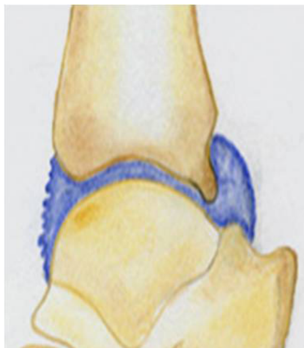
Figure 3 The neutral position in mild dorsiflexion increases the capsular distension facilitating the anterior pathologies treatment.

Pigmented villonodular synovitis (PVNS) is a rare, locally aggressive benign proliferative pathology of synovial tissue. The World Health Organisation (WHO) has classified these lesions separately as PVNS and giant cell tumour of tendon sheath (GCTTS) and reported that the distinction is based on the behaviour of the