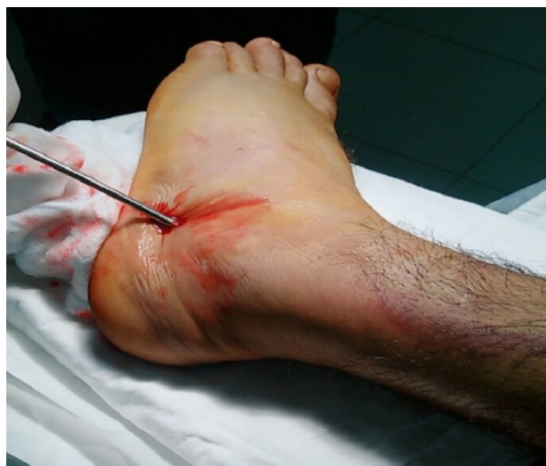
Figure 1 Our technique of percutaneous reduction and fixation of calcaneal fractures.

All patients underwent percutaneous reduction and fixation under C-arm fluoroscope by the same consultant Orthopaedic surgeon. The technique involved placing the patient in lateral position, with the fracture side facing upwards above the normal foot. Under aseptic measures, tourniquet applied but not inflated. Fluoroscope was inverted so that the foot rest on the receiver site in a true lateral view. A line drawn on the posterior border of lateral malleolus about one-thumb breadth below the tip of lateral malleolus, a stiemann pin 3-4 mm was introduced between the fragments to a depth of at least 1 inch (Figure 1). Force was generated towards the heel side to disimpact the fragments. As sufficient force was required and k-wires would bend, hence stiemann pin used for disimpaction and its tip was directed towards the impacted segment, which was pushed superiorly so that our sub-talar angle was regained. A 2 mm k-wire was placed on the skin to determine the position under C-arm fluoroscope, where this elevated fragment can be held. Then this k-wire was inserted from the lateral aspect of tendoachilles in the same direction that we determined (Figure 2). This wire held the fragment and it was advanced distally up to the normal tarsal bone. Another k-wire was passed parallel to it at the same level to hold the same fragment. A third k-wire was inserted to hold the extra-articular fragment under