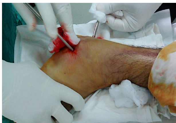
Figure 2 Our technique of percutaneous reduction and fixation of calcaneal fractures.