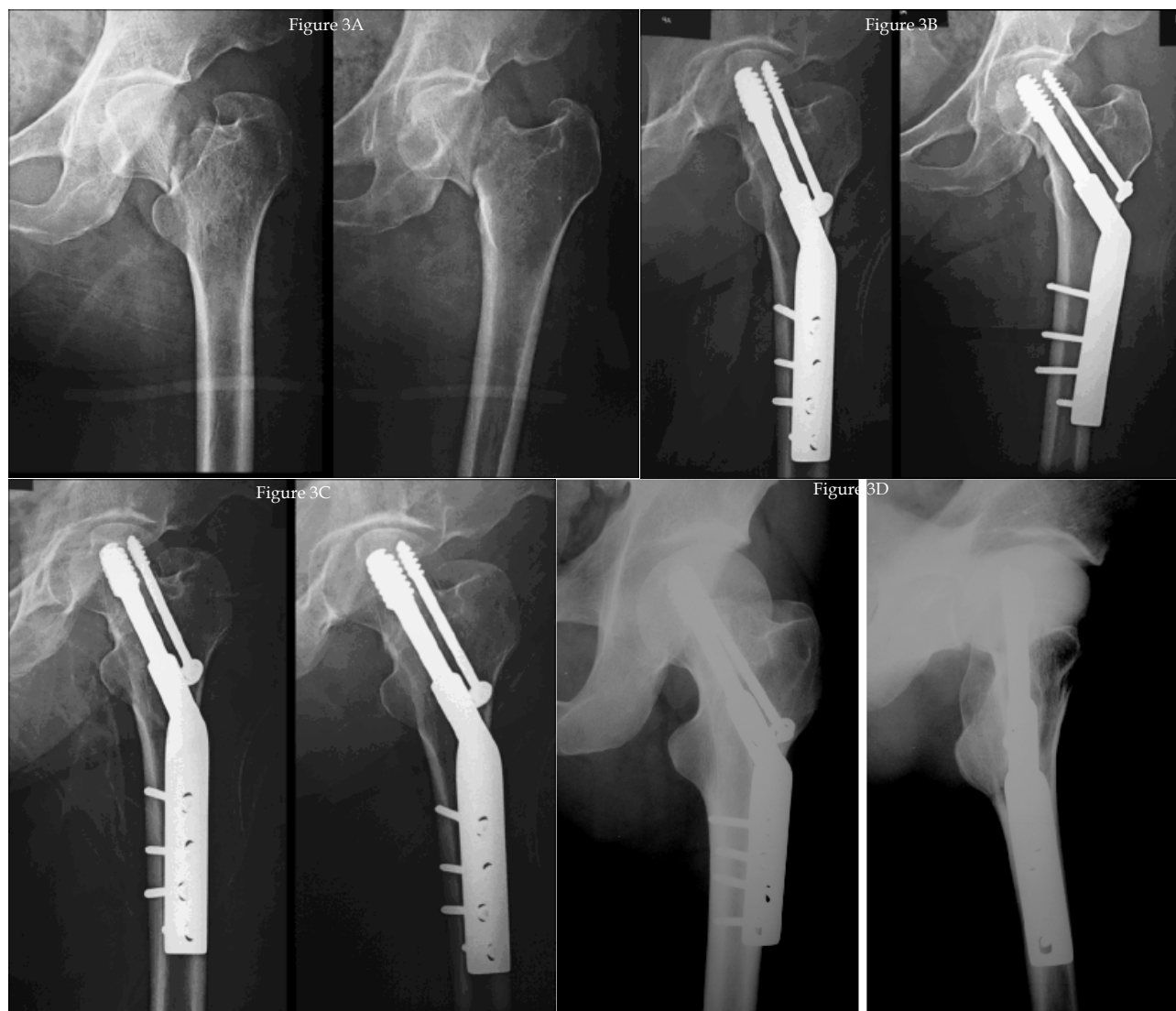
Figure 3A 62 year-old male patient with displaced fracture neck femur. Figure 3C The radiographs 6 months after surgery.