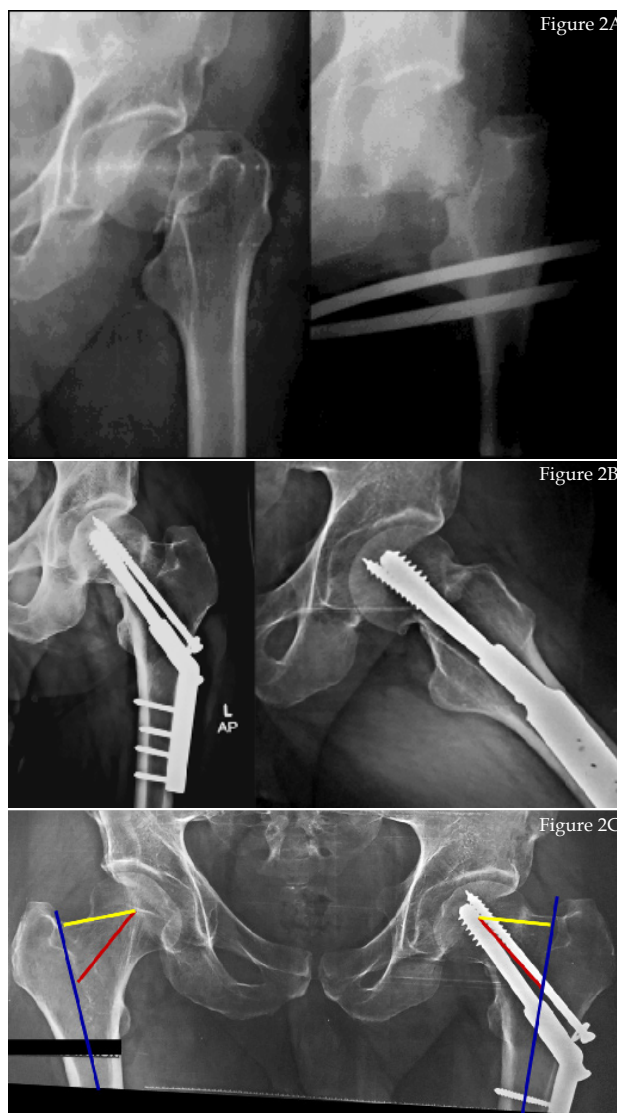
Figure 2A 58 year-old male patient with displaced fracture neck femur. Figure 2B The radiographs three months after surgery with complete bone healing. Figure 2C At the final follow up, the following parameters are measured on both sides: The femoral neck length (red line), horizontal offset of the femoral head (yellow line) and the neck shaft angle (between the red and blue line).

The complications did not affect the final outcome except in 7 cases. The four cases that were complicated by nonunion were treated by hemiarthroplasty while the three cases that were complicated by avascular necrosis were treated by total hip arthroplasty. The three cases with superficial wound infection were treated by wound debridement and systemic antibiotics. The two cases with bed sores improved once they started weight bearing.