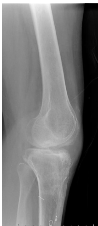
Figure 6 Lateral radiograph status post complete patellectomy.

easy and reliable use, excellent outcomes, no displacement and no hardware removals using FAP for comminuted fractures [28,39-41] . Wurm followed 35 patients with FAP and found good outcomes with no EM deficits and only one implant related complication [30] .