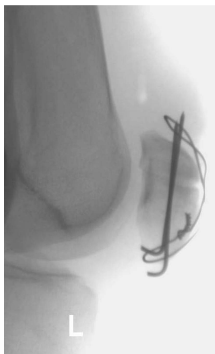
Figure 4 Radiographs demonstrate tension band construct used to treat transverse patellar fracture.

not be possible. Low suspicion should exist to obtain imaging [25] . Orthogonal knee radiographs should be obtained first (Figure 3). CT may be worthwhile in some cases. Lazaro noted that CT changed operative management in half of cases, especially when there was comminution or inferior pole involvement [26] .