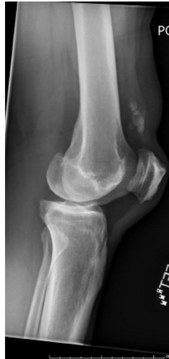
Figure 1 Lateral radiograph demonstrating superior pole patellar avulsion representative of quadriceps tendon rupture.

In addition to timing, the other primary factor affecting success is the fixation method. Mid-substance QT ruptures, while uncommon, can be successfully repaired using end-to-end suture fixation [7] . With acute rupture from the superior patella, several techniques may be utilized for repair, with debate ongoing in regard to most efficacious methods. Regardless of chosen fixation, clean tendon edges should be prepared and a locking, grasping suture should be placed through the tendon (Figure 2). The “gold standard,” of QT repair involves passing the suture ends through transosseous patellar drill tunnels and tying them over the inferior patellar. Some have suggested suture anchors used to fixate the tendon may provide increased load to failure with less repair site gapping, while offering comparable clinical outcomes [11-14] . Suture and anchor type may also play a role in construct strength, as knotless anchors loaded with Arthrex® SutureTape (Arthrex, Inc; Naples, FL) have demonstrated decreased cyclical displacement, improved stiffness and greater loads to failure compared to standard suture anchors and transosseous tunnels using high-strength #2 suture in biomechanical cadaveric studies [15] . Other theoretical advantages to suture anchor