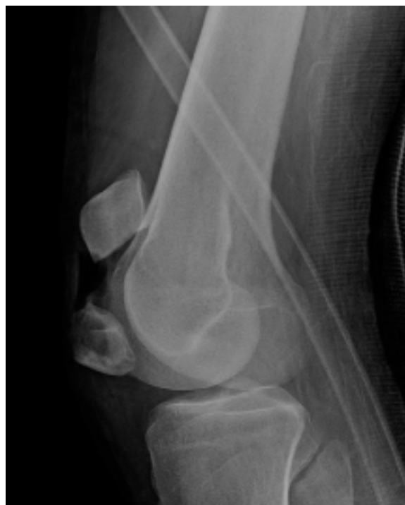
Figure 3 Lateral radiograph demonstrating simple, transverse patella fracture.

Patients complain of anterior knee pain and a hemarthrosis may be present. Depending on severity, straight leg raise may or may