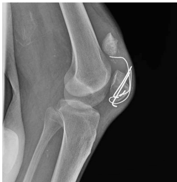
Figure 5 Lateral radiograph demonstrating failure of tension band construct

With increasing comminution, tension band principles may not provide stable osteosynthesis. In these cases, options include plating, cerclage wiring or patellectomy (Figure 6). Current literature supports patellar preservation and avoidance of complete patellectomy, as this decreases EM mechanical advantage by almost 50% [10,25,37] . Partial patellectomy may be appropriate with small, de-vascularized fragments of the superior or inferior poles. At least 60% of native patella should be preserved or functional results are equivalent to complete patellectomy [38] . In cases of partial patellectomy, the QT or PT is whipstitched and advanced to bone. Decreases in patellectomy have paralleled improvements in patellar plating, including fixed angle mini-fragment and mesh plates. Fixed angle plates (FAP) can be used for simple or comminuted fractures and may be beneficial in osteoporotic bone (Figure 7) [30] . Multiple authors have demonstrated