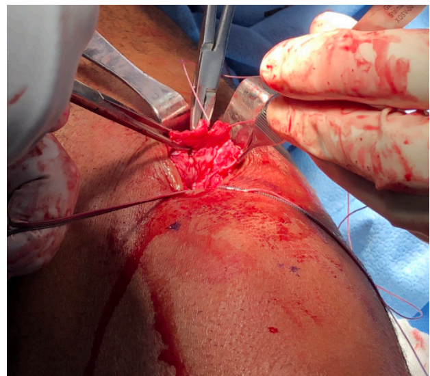
Figure 2 Intraoperative quadriceps tendon rupture with heavy sutures being placed through the tendon prior to fixation.

fixation include smaller incisions, less soft tissue stripping and more aggressive early therapy [12] . However, there is a paucity of literature comparing clinical outcomes with regards to fixation methods. One such study was performed by Plesser, examining 27 patients with no difference in outcomes or failures between transosseous and suture anchor repairs [16] . Ciriello noted that transosseous drill holes were most commonly used, and did not appear to affect outcomes; however, they did not include studies using suture anchors [7] . Arthroscopic repair techniques have been recently described with excellent functional results, no failures, and lower risk of wound complications. No comparative data exists comparing arthroscopic and open techniques, therefore it remains too soon to consider arthroscopic procedures equivalent. Overall, it appears transosseous and suture anchor fixation can provide acceptable outcomes in acute repairs. Although biomechanical and soft tissue advantages are seen