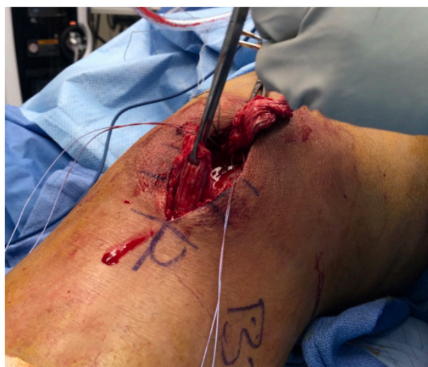
Figure 8 Intraoperative patellar tendon rupture with suture anchor fixation at inferior patellar pole.

and reapproximated through transosseous tunnels, suture anchors, or cortical button fixation. Suture anchor preparation is shown in Figure 8. Comparison of transosseous tunnels and suture anchors has shown similar results in PT ruptures when compared to QT ruptures as discussed above. Biomechanical studies by Lanzi and Ettinger demonstrated less gap formation and higher failure loads using suture anchors for PT repair [50,51] . The debate continues, as Sherman did not show any differences in load to failure [52] . Cortical button fixation has also been explored for PT ruptures. Transosseous tunnels are created and a button device, similar to that used in ACL graft fixation, is inserted, flipped and tensioned over the superior patella. Ode used 23 cadavers to compare transosseous, suture anchor and cortical button repair and noted significantly less gap formation and two-times higher failure loads with cortical buttons compared to the other groups [53] . Comparative clinical trials evaluating PT repair fixation methods remain sparse. Meyer augmented acute repairs with oblique bone tunnels to create a “belt-over-suspenders” repair to compress the repaired tendon [17] . Schütte used an internal brace technique, creating transverse tunnels in the tibial tuberosity and patella and using Arthrex® Fibertapes (Arthrex, Inc; Naples, FL), in “O” and “X”