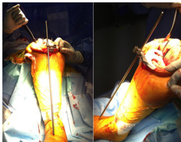
Figure 2 Accuracy of tibial cutting block checked by conventional extramedullary guide rod.