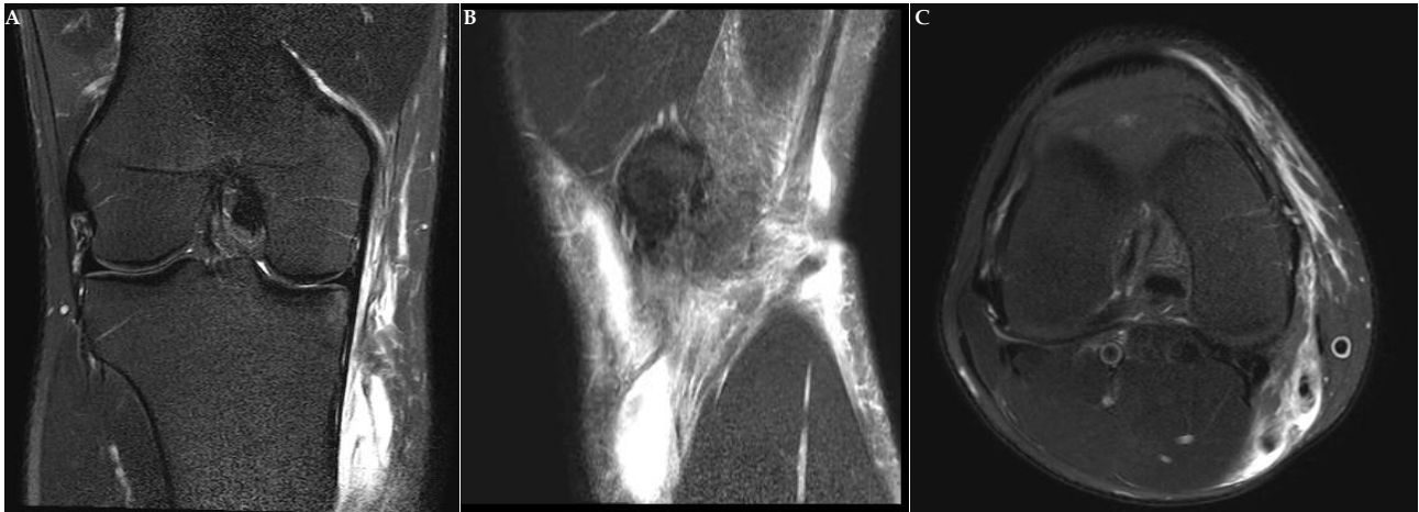
Figure 1A, 1B, 1C: Coronal, Sagittal and Axial views demonstrating discontinuity of the semitendinosus tendon and extensive oedema in the pes anserine region.

knee flexion. There was reduced tension in the palpable part of the semitendinosus. Knee flexion power was reduced compared to the contralateral side. MRI of the right knee confirmed complete rupture of the semitendinosus and gracilis components at the pes anserine but intact sartorius attachment. The semimembranosus was also intact (Figure 1A, 1B, 1C).