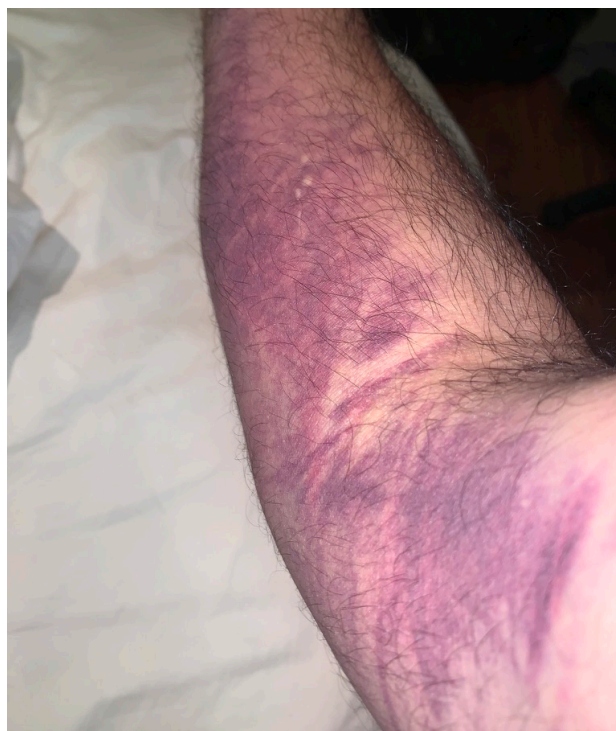
Figure 1C Nearly two weeks following the injury. This picture is taken prior to initial consultation with the orthopedic surgeon. Ecchymosis has clearly spread from the distal forearm over the distribution into the arm at mid bicep.