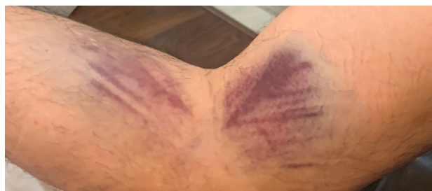
Figure 1A A few days after injury. Anterior sided ecchymosis along the proximal forearm over course of pronator teres muscle and the distal bicep is appreciated.

Upon follow up at two weeks, the ecchymosis had improved but