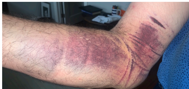
Figure 1B One week after the injury. Ecchymosis spreads further down the anterior forearm over the medial elbow.