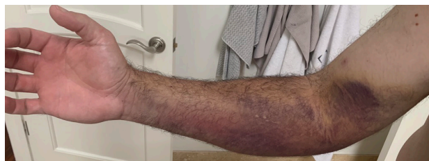
Figure 1D This picture is taken after initial consultation with the orthopedic surgeon, just over two weeks after injury. Ecchymosis is still prominent with increased discoloration.