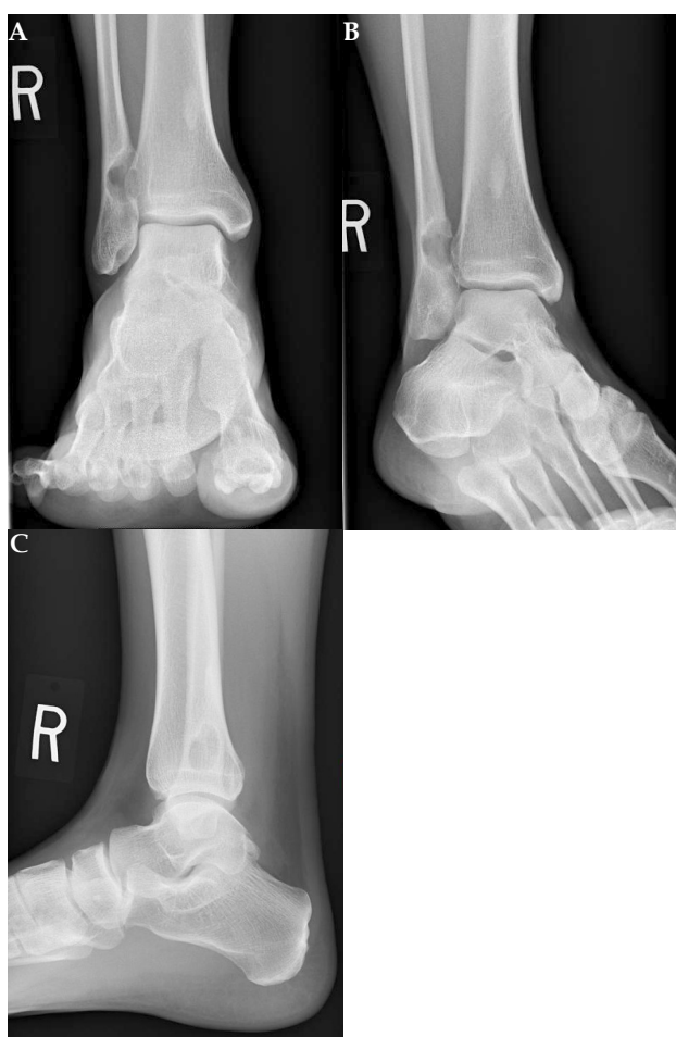
Figure 1 (a) Anteroposterior view, (b) sagittal view, (c) oblique view of the right fibula lesion showing intense peripheral enhancement.

Two years after the initial surgical encounter the patient returned again with right ankle pain. Again, a lesion was seen on MRI with a biopsy that was positive for smooth muscle actin and polytypic cytokeratin. The patient was then treated similarly to the first time in respect to the right fibular lesion, however, during this procedure one angioliipoma and two lipomas from the right arm as well as one angioliipoma and one lipoma from the left arm were removed. One year later the patient for the third time presented with ankle pain and another recurrence of myoepithelioma confirmed by X-ray and MRI and was treated with curettage. The final known recurrence happened another year after the second recurrence and was confirmed by biopsy. This time the patient presented with an enlarging lump on the ankle with pain and sought a more definitive treatment. Therefore, the