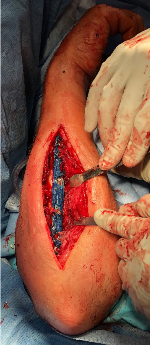
Figure 2 Demonstrates plating of ulnar shaft fracture using antibiotic coated PMMA mixed with methylene blue.