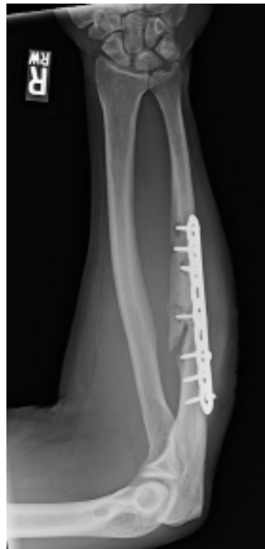
Figure 4 Anteroposterior radiograph of right forearm status post ulnar shaft open reduction and internal fixation demonstrating hardware loosening and loss of reduction.

old female also sustained a closed, midshaft humerus fracture which was initially treated with ORIF. Throughout her post-operative period there was concern for nonunion (Figure 3) and revision ORIF was performed approximately eight months after her initial surgery. A 4.5 mm dynamic compression plate was used at that time. Three weeks after her revision ORIF she was noted to have a surgical site infection and she was taken back to the operating room for irrigation and debridement, where cultures grew Staphylococcus aureus . Antibiotic impregnated PMMA 4.5mm dynamic compression plate was used to maintain fracture stability at prior nonunion site. She received intravenous cefazolin and rifampin for 60 days after surgery. Fracture