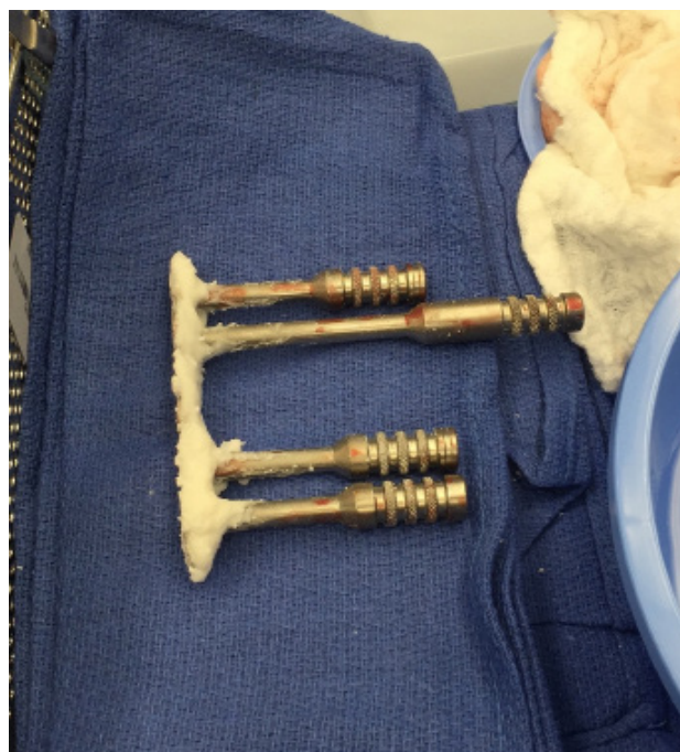
Figure 1 The plate is coated with antibiotic impregnated PMMA with locking guide towers in place to prevent cement from disrupting screw hole locking mechanism.

A total of six patients were identified, all of which had humeral or forearm shaft fractures. Three patients were treated for hardware infection or septic nonunion as identified by history, physical examination, radiographs, and laboratory markers. Three other patients were prophylactically treated at the discretion of the surgeon in clinical scenarios deemed at high risk for infection. The majority of participants were male and <50 years old. Complete demographic and surgical information regarding each patient can be found in Table 1.