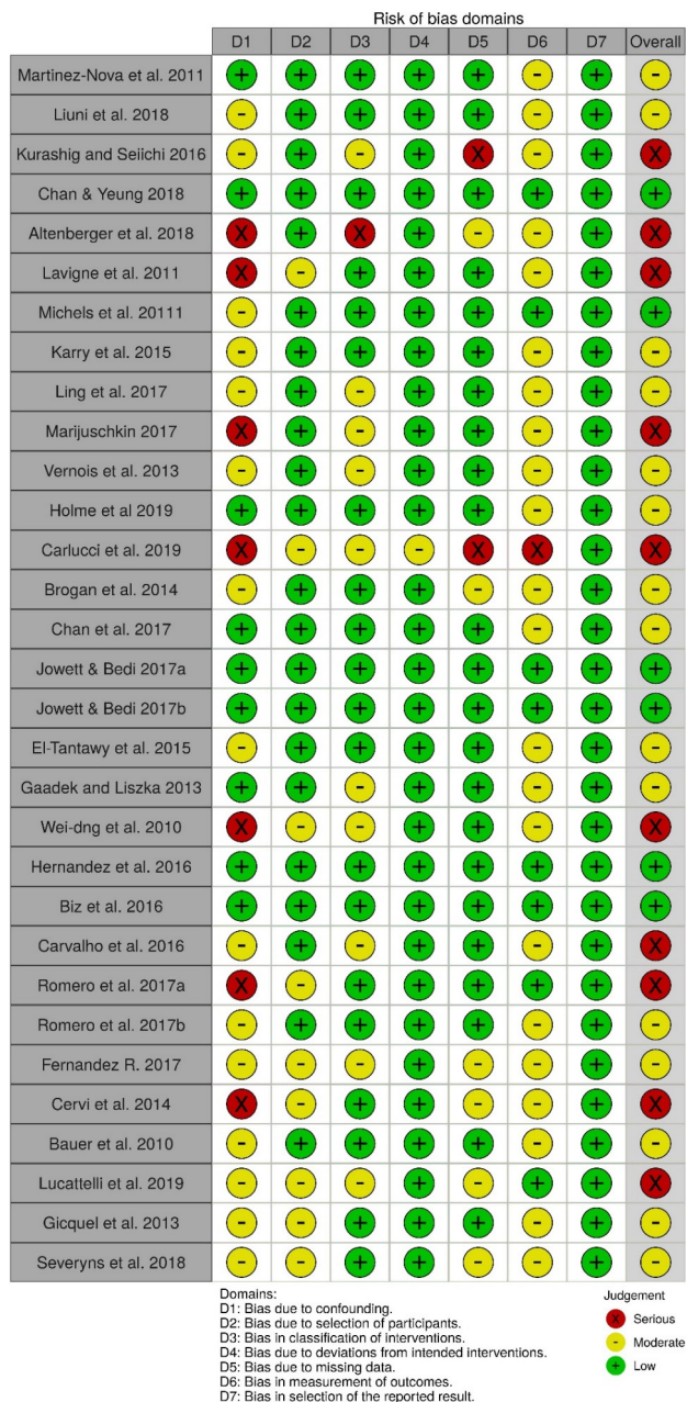
Figure 2A Risk of Bias In Non-randomised studies (ROBINS-I), traffic light plot.

Collaboration. This study will not only focus on RCTs, but also observational studies and Non-randomised controlled trials to