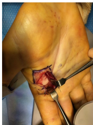
Figure 2 Clinical aspect after volar approach. The dislocated MCP joint is visualized, the entrapped volar plate is seen adjacent to the metacarpal head.