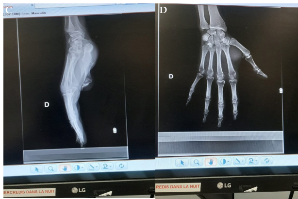
Figure 3 Right index finger anteroposterior (C) and lateral (D) radiographs at 6-weeks follow-up demonstrate a well reduced index MCP joint.

plate, making the reduction more stable. The dislocation displaces the neurovascular bundle superficially and immediately under the skin. This change in anatomy increases the risk of damage to the neurovascular structures through the volar approach. For this, volar approach is recommended to experienced surgeons [2,3,5,7] .