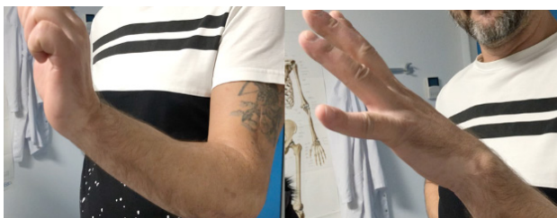
Figure 5 After one year and a half, the patient presented a stable elbow with a range of motion (ROM) of 30°-120°, 5/5 strength of the wrist and 4/5 for finger extension. The new electromyography (EMG) showed reinnervation signs compared to the previous one.

EF, external fixator; DJD, Dynamic Joint Distractor; CEH, Compass Elbow Hinge