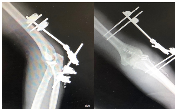
Figure 2 Postoperative X-ray control: lateral view (left); anteroposterior view (right).