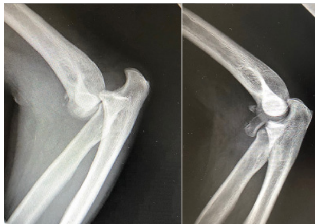
Figure 1 Pre- (left) and post-reduction (right) images.

An intensive rehabilitation (physical therapy) program was arranged, with poor compliance from the patient and multiple missed appointments. Electromyography performed 4 months after the initial surgery described a severe axonal injury. At 6 months of follow-up