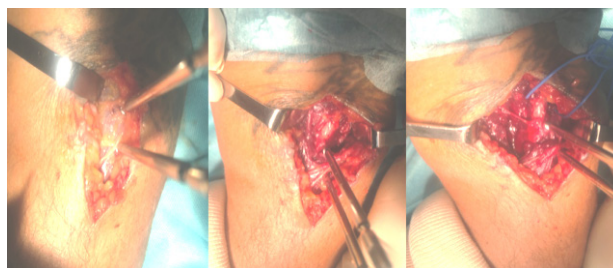
Figure 3 Intraoperative images during external fixator (EF) removal. The close relationship between the pin and the radial nerve can be appreciated.