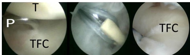
Figure 3 Ulnar triangular fibrocartilage (TFC) tear with detachment from the ulnar fovea. Arthroscopic repair using a knotless suture anchor (middle) and final result (right). P:probe; T:triquetrum.