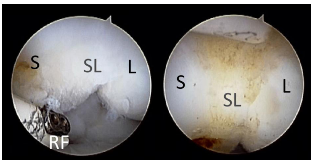
Figure 1 Partial scapholunate (SL) ligament tear before (left) and after (right) debridement and thermal shrinkage with a radiofrequency probe (RF). S: scaphoid; L: lunate.

Acute partial tears of the membranous portion of the SL ligament (Geissler type I) are thought to be amenable to immobilization alone. There may be a biomechanical advantage in immobilizing in supination [7] . In more extensive lesions involving the dorsal part of the ligament the chances of chronic instability become greater. In such lesions (Geissler type II and III) scapholunate interval stability should be assessed from a midcarpal portal as well. Reduction and temporary pinning of the SL interval is the treatment of choice of these lesions and is supplemented with mechanical debridement or radiofrequency probe thermal shrinkage of the ligament [12] (Figure 1). However, overzealous use of radiofrequency probes in the wrist is to be avoided [13] . When a patient presents with gross SL instability (Geissler type IV, positive "drive through" sign) there usually is a complete SL ligament tear and consideration should be given to open repair with suture anchors. There have been reports of arthroscopic assisted complete SL ligament tear repair (either dorsal [14,15] or volar [5] ) but at this point open repair is considered the gold standard.