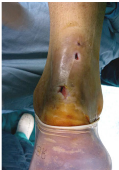
Figure 1 Multiple skin dehiscences at the level of the previous achilles tendon reconstruction.

the site of the previous surgery, with spontaneous purulent discharge (Figure 1). Range of motion (ROM) of the ankle was restricted and lack of strength in both plantar or dorsal flexion was also detected. A bilateral significant calf atrophy was also described. Thompson test was negative. Routine blood tests including complete blood count and chemistry panel, along with erythrocyte sedimentation rate (ESR), C-reactive protein (CRP) and fibrinogen were performed. Before empiric antimicrobial therapy was started, samples from wound discharge were aseptically collected using a sterile swab and studied for identification of isolates by Gram stain and bacterial culture followed by in vitro antibiotic susceptibility testing.