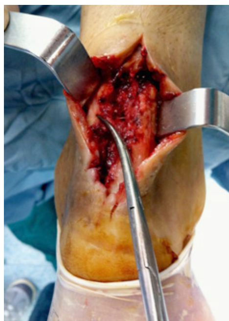
Figure 2 Harvest of the synthetic graft used to reinforce the tendon reconstruction.

Eleven days after admission, the patient underwent revision of the previous tenorrhaphy. When the paratenon was incised, it revealed a liquid and copious corpuscolated exudates, mixed with residual portion of the synthetic tendon graft used. Achilles tendon was hypertrophic but intact. The Ligastic® graft was removed along with all of the surrounding infected tissue, and extensive debridement was performed (Figure 2) and a specimen was collected for the histological examination (Figure 3). After surgery, a short leg cast was applied and progressive weight bearing was allowed 10 days after surgery. No post-operative complications were registered. Histological exam of the tissue harvested during the operation showed inflammatory infiltrate in a context of connective fibrous tissue, with multiple foci of granulation tissue, foreign body giant cell reaction and fibrin. Three days after surgery the patient had no more fever and he was discharged. At the 12-month follow-up, patient reported full return to daily and work activities with no restrictions or residual pain. Physical examination showed a complete recovery of range of motion of the ankle with no local signs of infection or tissue adhesions. Plantar flexion strength was satisfactory in a side-to-side evaluation (S/S). The AOFAS ankle-hindfoot score was 98 and the patient was fully satisfied with the treatment.