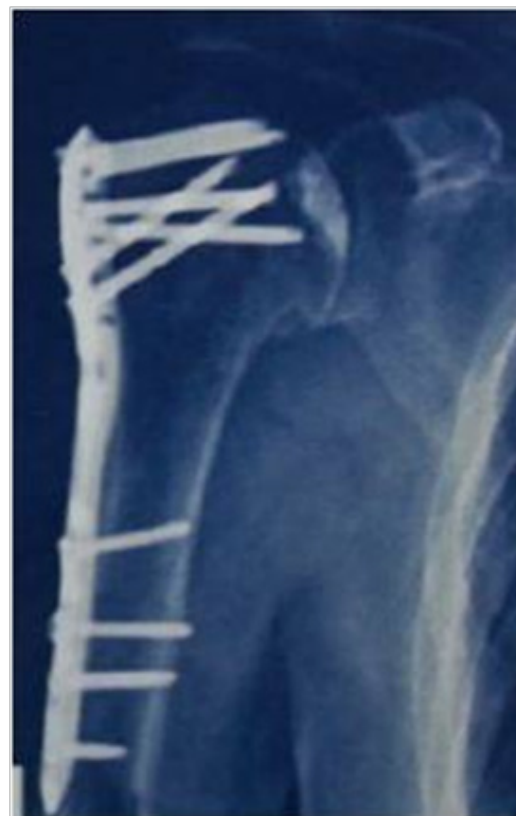
Figure 4 Avascular necrosis in a patient with 4-part fracture.