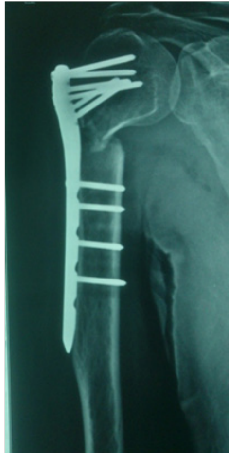
Figure 3 Varus malunion in a patient with 4-part fracture.