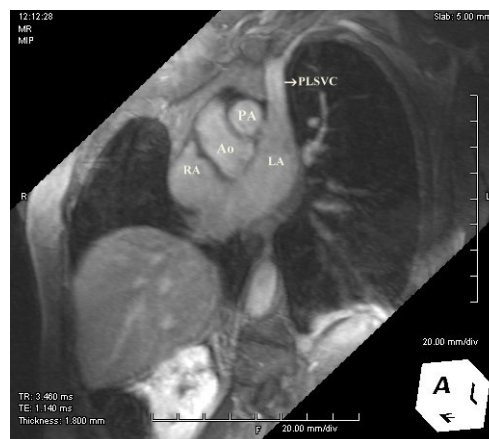
Figure 1 Dark blood MRA of the chest showing a left superior venacava draining into the left atrium. PLSVC: Persistent left superior venacava. Ao: Aorta, PA: Pulmonary artery, LA: Left atrium, RA: Right atrium.