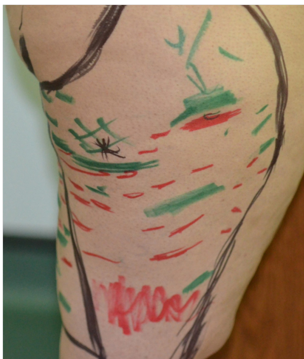
Figure 1 Marking of cellulite.

The tremendous demand by woman of all ages for cellulite therapy has resulted in several studies to find the best cellulite treatment.