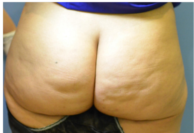
Figure 3 Before treatment.