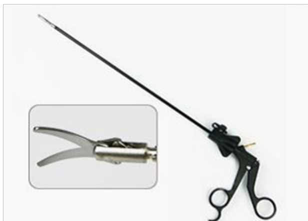
Figure 2 Endoscopic scissors with a curved tip.

Both noninvasive and invasive techniques have been described in literature. However, the treatments in these studies lacked long-term efficacy and longevity [1] . In fact, no one treatment is completely successful [1] .