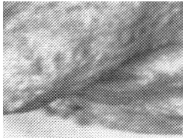
Figure 3 Multiple odontogenic cysts