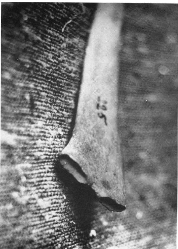
Figure 1 A bifid rib- Reprinted with permission from the Cambridge Journal of Medical History.