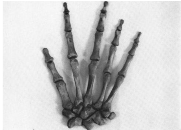
Figure 2 Brachymetacarpalia (shortened 4th finger)

Paleodermatology is the study of the integument and associated diseases as demonstrated in the remains of former times [8] . The skeletal remains of two excavated Egyptian brothers of the Dynastic period present with findings consistent with BCNS [9] . The younger male's (20-25 years old) remains demonstrate findings consistent with an odontogenic cyst, a bifid rib (Figure 1), incompletely fused sacral laminae and brachymetacarpalia (shortened 4th finger) (Figure 2). The older male (60+/- 10 years) presented with multiple probable odontogenic cysts (Figure 3), multiple bifid ribs, incomplete fusion of the sacrum, disturbed vertebra from osteoarthritis and extensive ventral lipping, and enlarged sella turcica with an asymmetrical occiput (Figure 4), and brachymetacarpalia of the 4th digit. The paleo-evidence clearly supports the diagnosis of BCNS under the current criteria. Both brothers exhibited the major criteria of