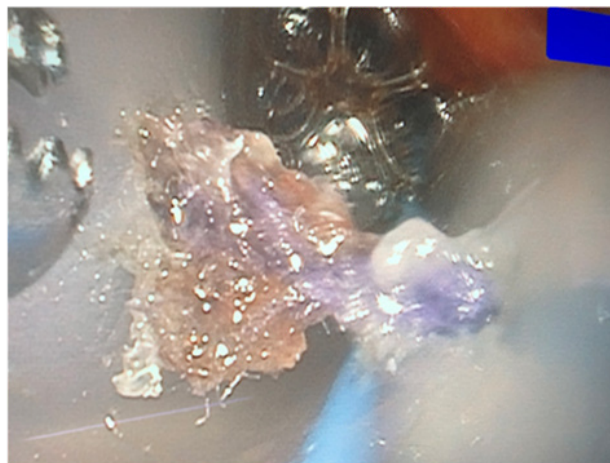
Figure 1 Visualization of suture (purple) used to close rib space following thoracotomy.