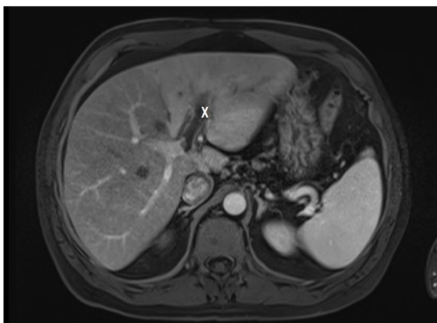
Figure 2 Abdominal MRI (Axial viba arterial view): X Portal vein thrombosis.