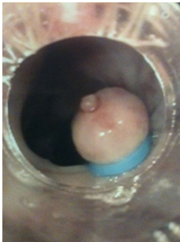
Figure 2 Esophageal varices band ligation of a varix with a white nipple.

Minor complications of EVL, that respond well to oral analgesia and antacids, include chest pain and transient dysphagia. Serious,