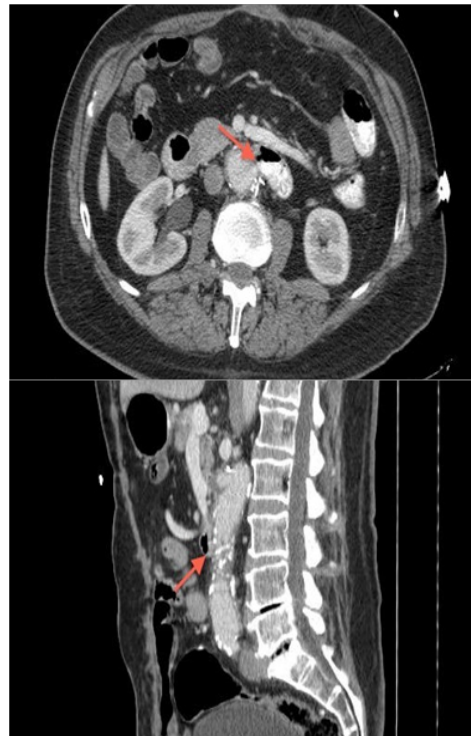
Figure 1 CT scan of abdomen and pelvis with IV and PO contrast revealing an infrarenal saccular aneurysm with direct connection to the third portion of the duodenum (arrow).

A CT scan of the abdomen and pelvis was performed and confirmed the presence of the fistulous tract associated with fusiform aneurysm of the abdominal aorta (Figure 1: axial and sagittal images, respectively, of CT A/P with IV and PO contrast revealing an