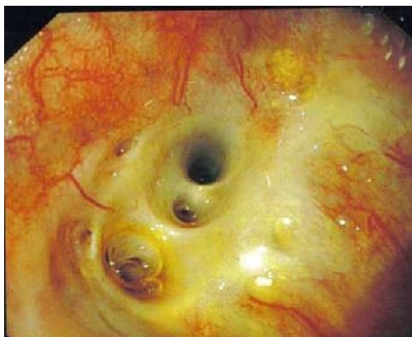
Figure 3 Portoenterostomy site.