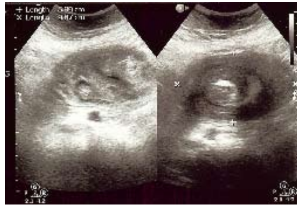
Figure 1 Transabdominal ultrasound study of the patient.

identified within the removed part of mesentery fatty tissue. No other primary or secondary neoplasms were identified (T2NxM0). The patient had a smooth recovery and she was referred to a tertiary oncology center for further evaluation and follow-up. She did not receive chemotherapy and since then she has been on a regular follow-up, without evidence of locoregional relapse or metastases.