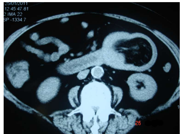
Figure 2 Computerised tomography study of the patient's abdomen. Thickening of the small bowel wall, with narrowing and polypoid mass (intussusception).