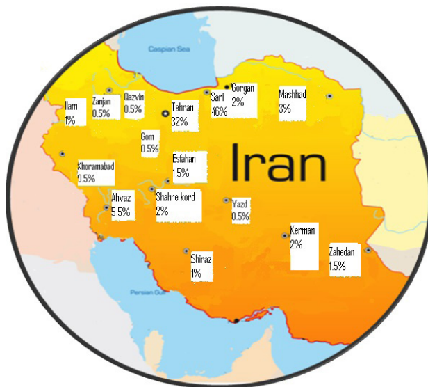
Figure 2 Schematic representation of the distribution of HCV positive thalassemic patients in different cities of Iran.

Out of 350 total patients, 187 were male, and 163 were female. Patients were either recently infected by HCV or had previous positive PCR results showing history of HCV infection. The 5’- UTR of 350 HCV positive serum samples were amplified and digested by appropriate restriction enzymes for genotype determination. Figure 1 demonstrates the analytical polyacrylamide gel electrophoresis of HCV types 1a, 1b, 2a, 2b, 3a, and 3b after digestion of the amplified DNA with the selected restriction enzymes.