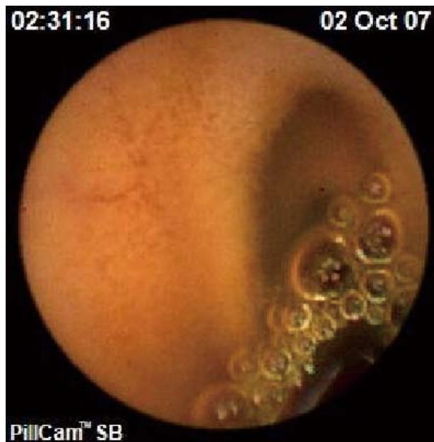
Figure 3 Normal finding at capsule endoscopy.